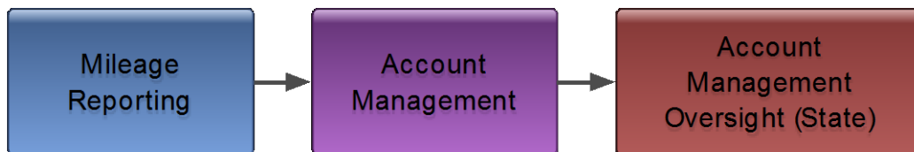
Figure 1-1 The Three Subsystems that Comprise the Road Charge System

A diagram of the architecture is included below.